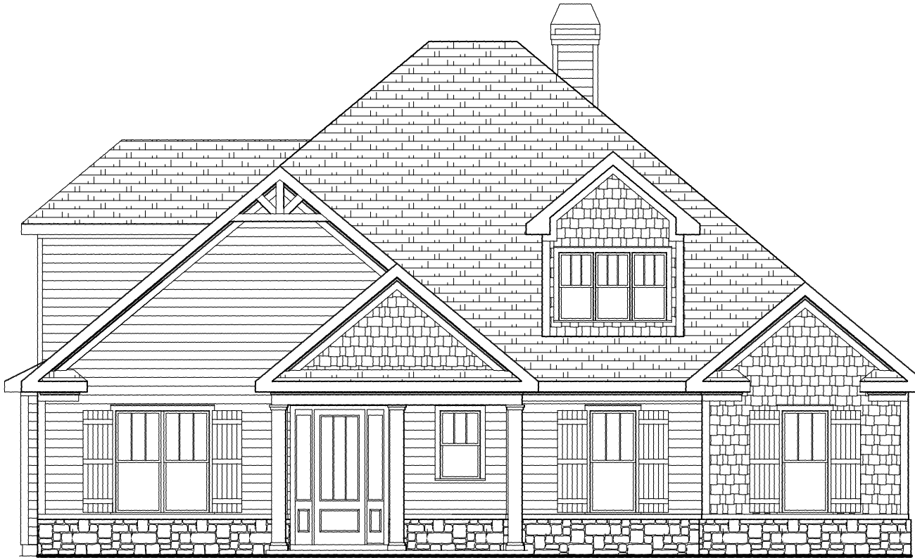
FRONT ELEVATION 2672 SQUARE FEET