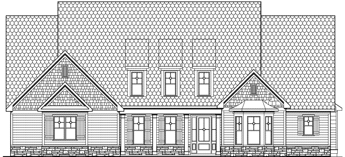
FRONT ELEVATION B 3503 SQUARE FEET

BECAUSE WE ARE ROUTINELY IMPROVING OUR DESIGNS, WE RESERVE THE RIGHT TO CHANGE PLANS, ELEVATIONS AND ROOM DIMENSIONS FROM THAT WHICH IS SHOWN ON THIS DOCUMENT. ROOM DIMENSIONS ARE APPROXIMATE.