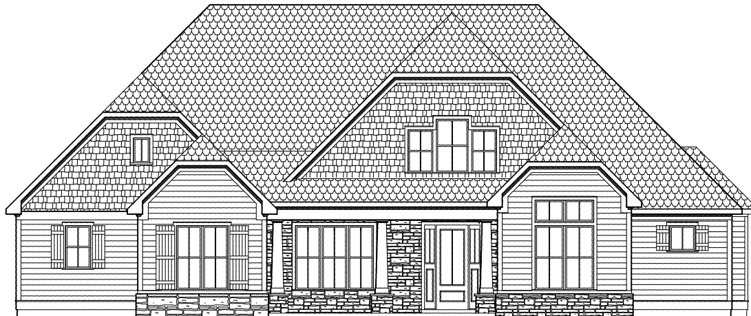
FRONT ELEVATION B 2846 SQUARE FEET