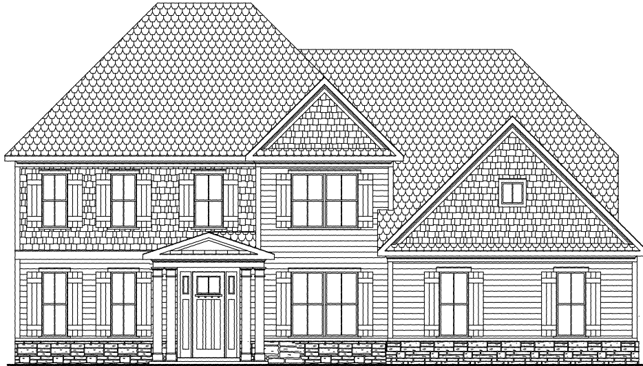
FRONT ELEVATION A 3171 SQUARE FEET