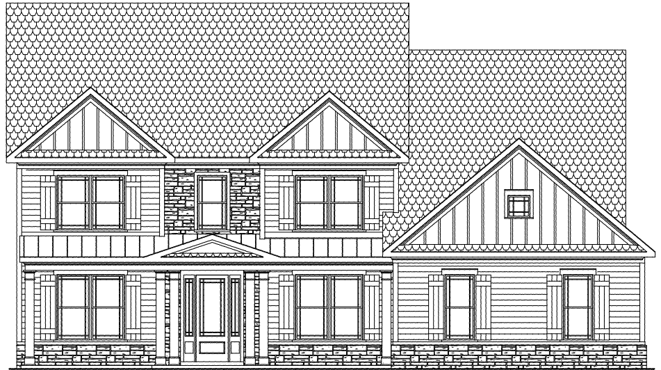
FRONT ELEVATION B 3198 SQUARE FEET

THE CANOE CLUB A REYNOLDS SIGNATURE COMMUNITY