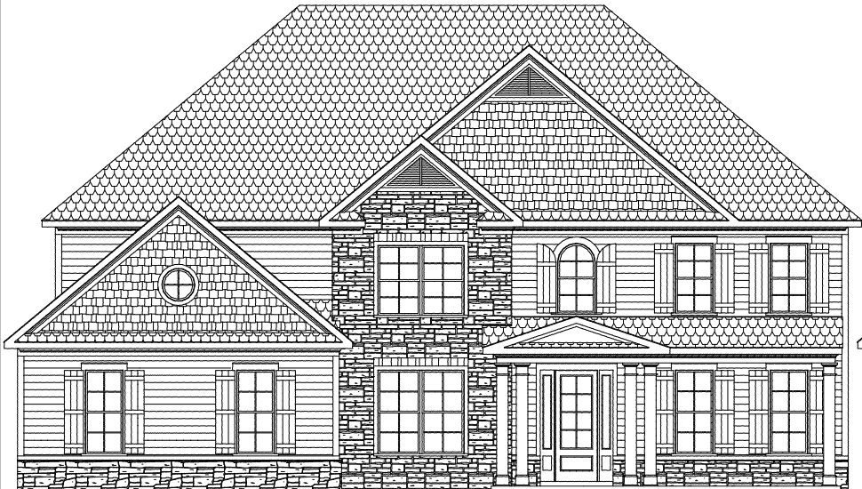
FRONT ELEVATION A 3598 SQUARE FEET