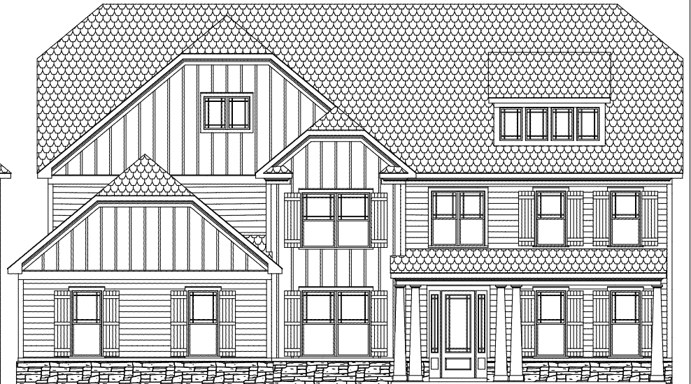
FRONT ELEVATION B 3598 SQUARE FEET

THE CANOE CLUB A REYNOLDS SIGNATURE COMMUNITY