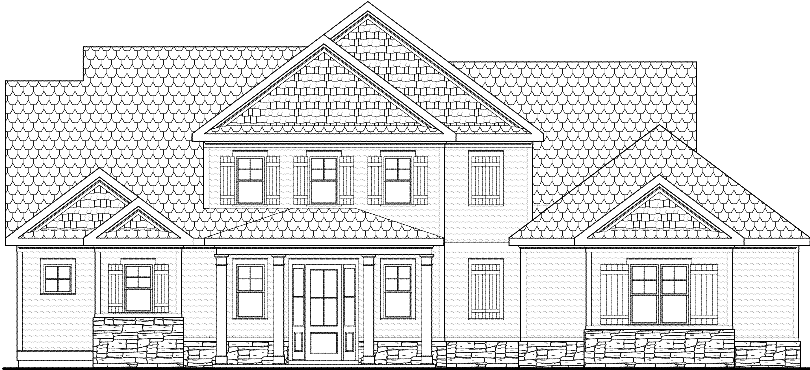
FRONT ELEVATION A 3115 SQUARE FEET